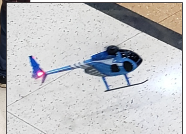
March is (un)officially Helicopter month.