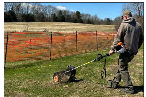
A little pre-mowing season field maintenance.