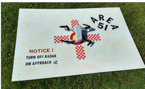
A new launch/landing pad?