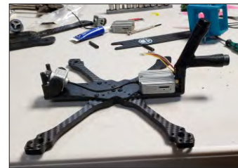
Arms on. New VTX.