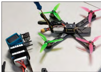
Drone after a RUD. (Rapid Unscheduled Disassembly)