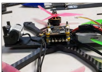
Flight controller & ESC remounted.