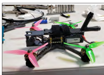
Motors remounted. New top plate.