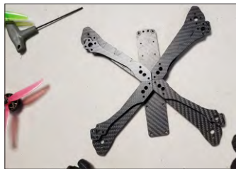
New parts. Thinner arms.