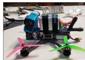
Go Pro & battery. Ready to go.