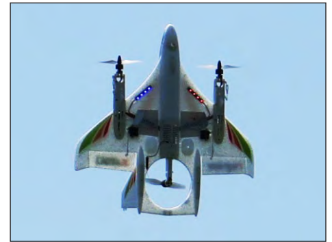
Joe always seems to have the most interesting flying machines.