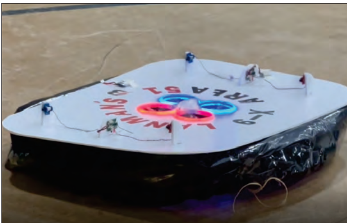
A most successful maiden voyage for Marks X-9 hovercraft.