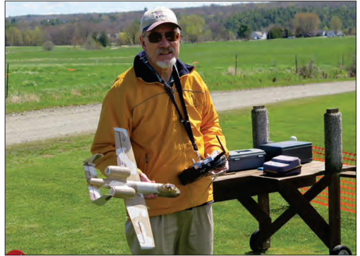
Spring has definitely sprung. The field and the trees are green and most of the pilots have come out of hibernation. Other than that, there's not much to report. Enjoy some pictures.